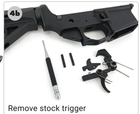
Remove stock trigger