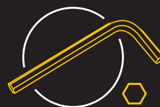
Flat head or hex key to remove pistol grip